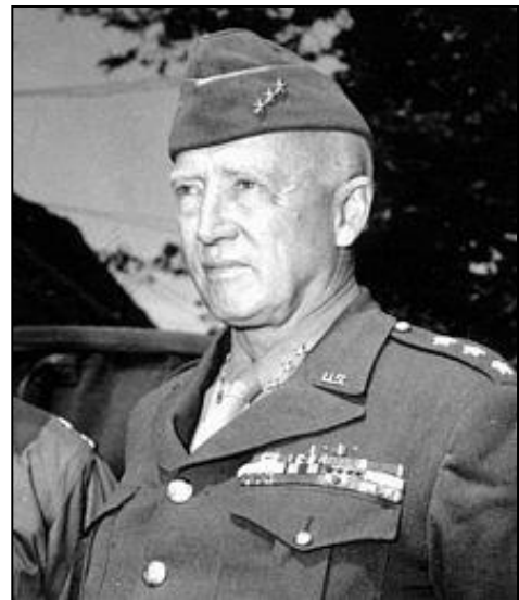
General George S. Patton, Jr. (1885-1945) Grandson of Benjamin D. Wilson

(The Patton Saber, Winter 2007 www.generalpatton.org )